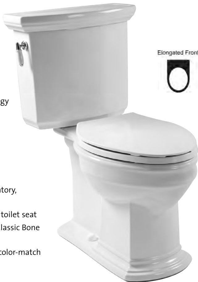
Model 115-106 with concealed trapway Shown with SB175 SmartClose™ Toilet Seat