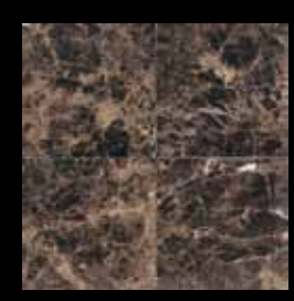
EMPERADOR DARK MARBLE M725