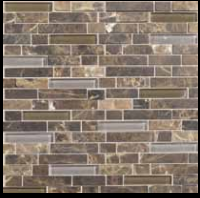
WISTERIA/TORTOISE BLEND SA54