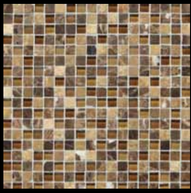
BUTTERNUT EMPERADOR BLEND SA60