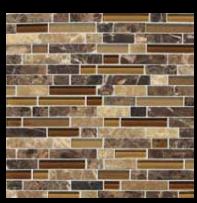
BUTTERNUT EMPERADOR BLEND SA60