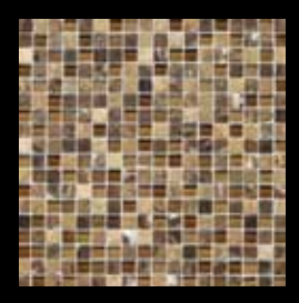
BUTTERNUT BLEND SA60