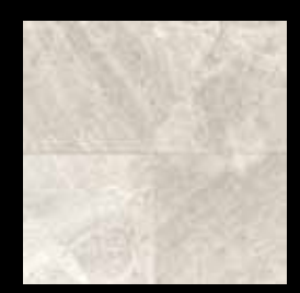
ARCTIC GRAY LIMESTONE L757