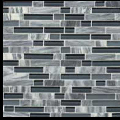
GLACIER GRAY MARBLE BLEND SA59