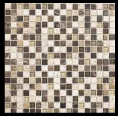
MORNINGSUN/TORTOISE/MUSHROOM BLEND SA52