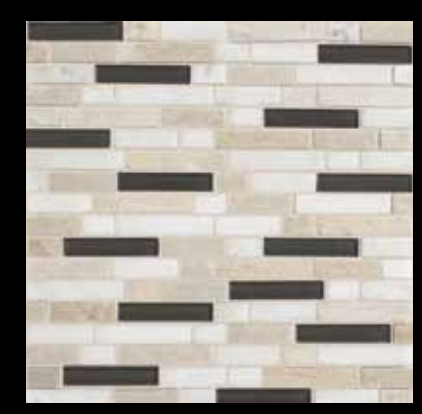
KINETIC KHAKI BLEND SA50