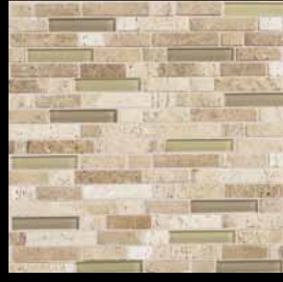
MUSHROOM/MORNING SUN BLEND SA53