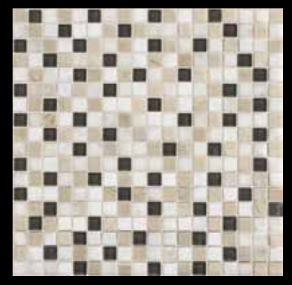
KINETIC KHAKI BLEND SA50