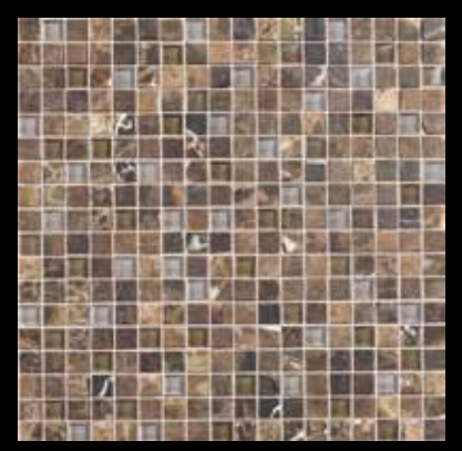
WISTERIA/TORTOISE BLEND SA54