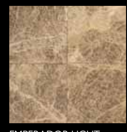
EMPERADOR LIGHT CLASSIC MARBLE M712