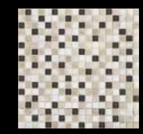
KINETIC KHAKI BLEND SA50