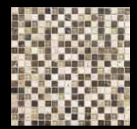
MORNING SUN/TORTOISE/ MUSHROOM BLEND SA52