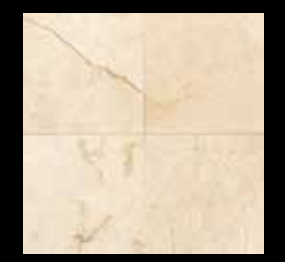
CREMA MARFIL CLASSICO MARBLE M722