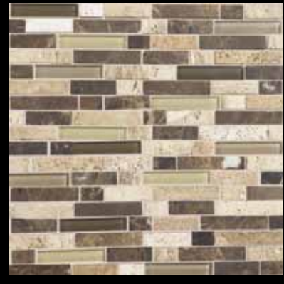
MORNINGSUN/TORTOISE/MUSHROOM BLEND SA52