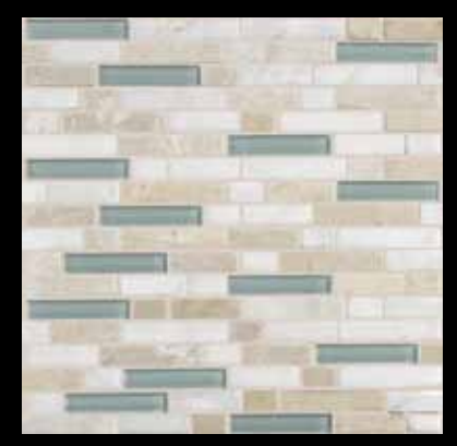
WHISPER GREEN BLEND SA51