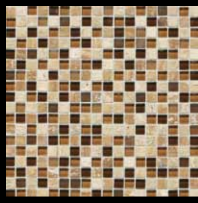
CARAMEL TRAVERTINO BLEND SA58