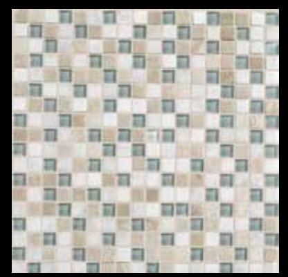
WHISPER GREEN BLEND SA5 I