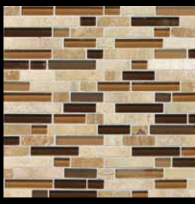
CARAMEL TRAVERTINO BLEND SA58