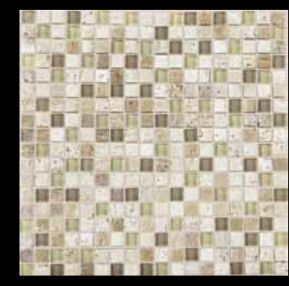
MUSHROOM/MORNING SUN BLEND