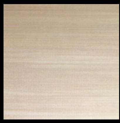
EMBER FLARE SK51