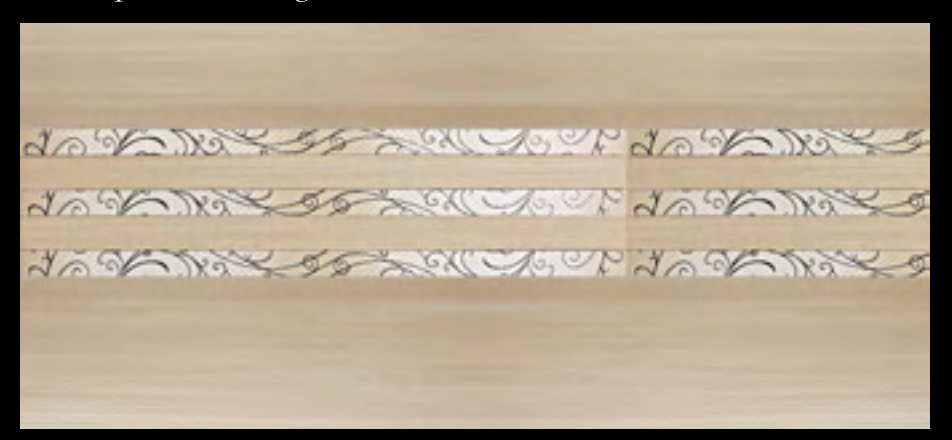
Backslpash features Ember Flare 12 x 24 Thin Wall Tile and Firelight Flicker/Ember Flare 6 x 24 Thin Wall Decorative Accent.