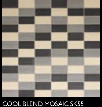
(FIRELIGHT FLICKER, SMOKY GLIMMER & MIDNIGHT GLOW)