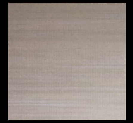
SMOKY GLIMMER SK53