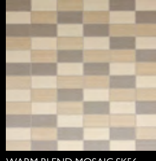
WARM BLEND MOSAIC SK56 (EMBER FLARE, TOASTED LUSTER LUSTER & FIRELIGHT FLICKER)