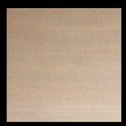
TOASTED LUSTER SK52