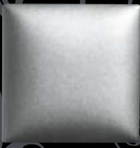
Pewter MT97 Small Square 2" x 2"

All accents are available in all colors.