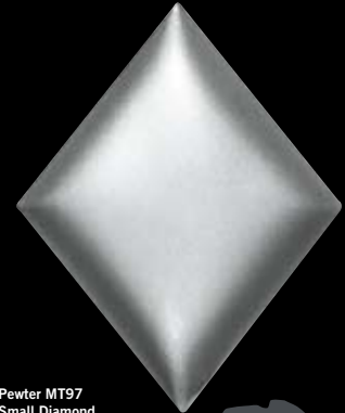
Pewter MT97 Small Diamond 3" x 4"