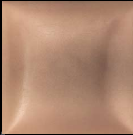
Copper MT96 Square 4" x 4"