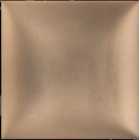
Bronze MT95 Square 4" x 4"