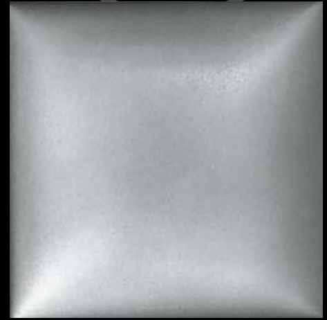
Pewter MT97 Square 4" x 4"

All accents are available in all colors.