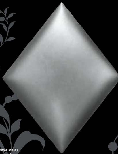
Pewter MT97 Diamond 5" x 6"