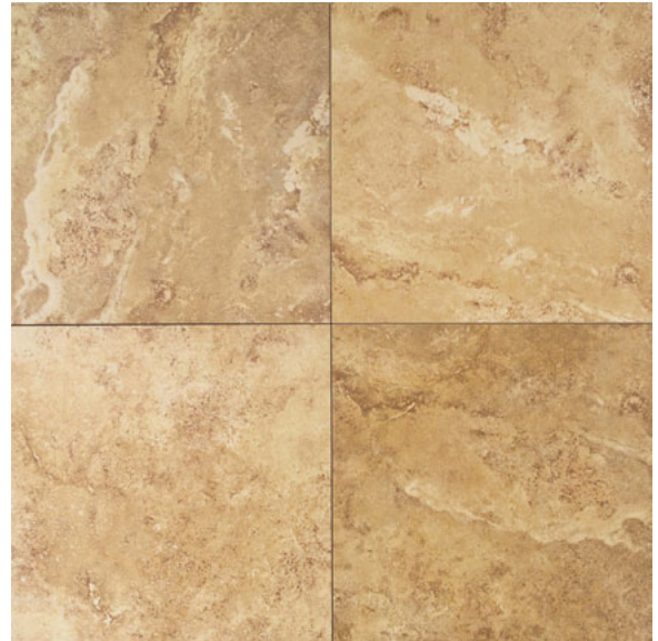
GOLDEN SIENNA PV04