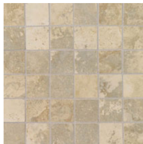
CHAMPAGNE PV02 2 x 2 Mosaic