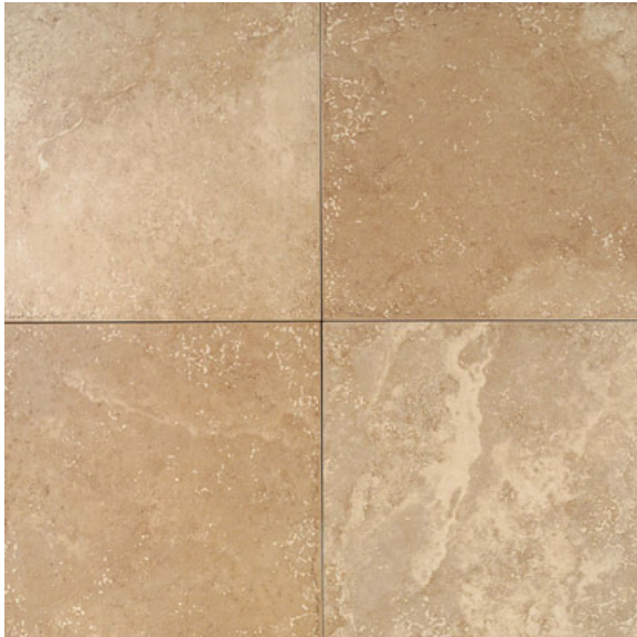
WARM WALNUT PV03