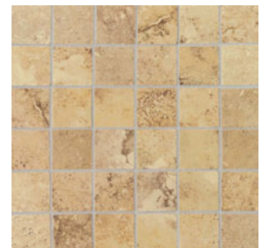
GOLDEN SIENNA PV04 2 x 2 Mosaic