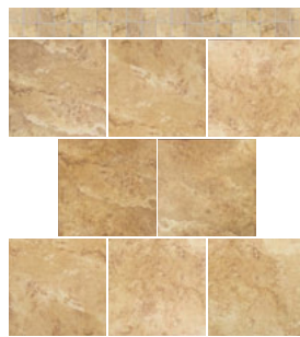
BRICK PATTERN WITH MOSAIC