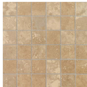
WARM WALNUT PV03 2 x 2 Mosaic