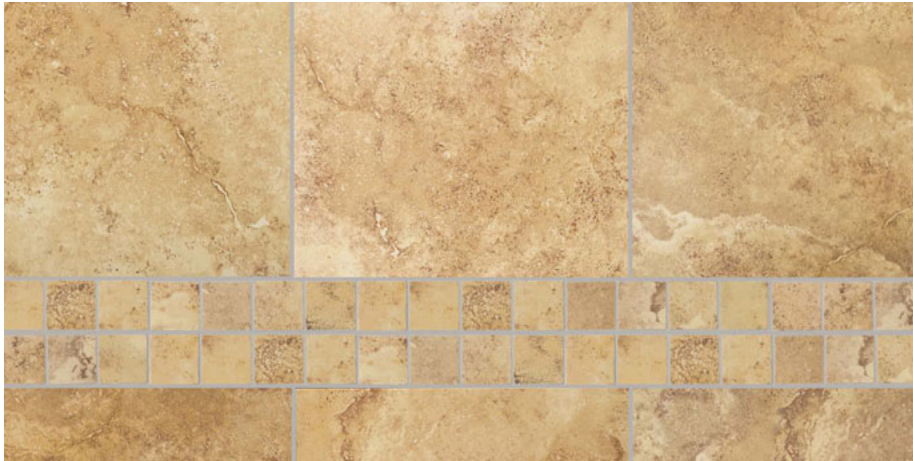
Backsplash features Golden Sienna 13 x 13 field tile with coordinating 2 x 2 mosaic.