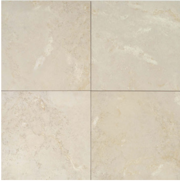
ANTIQUÉ IVORY PV01