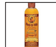
Howard Feed n' Wax