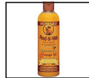
Howard Feed n' Wax