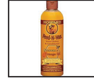
Howard Feed n' Wax