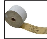
200 - 300 Grit Sandpaper (for repairs)