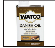
Watco Danish oil