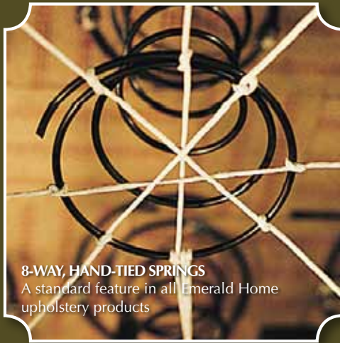
8-WAY, HAND-TIED SPRINGS A standard feature in all Emerald Home upholstery products