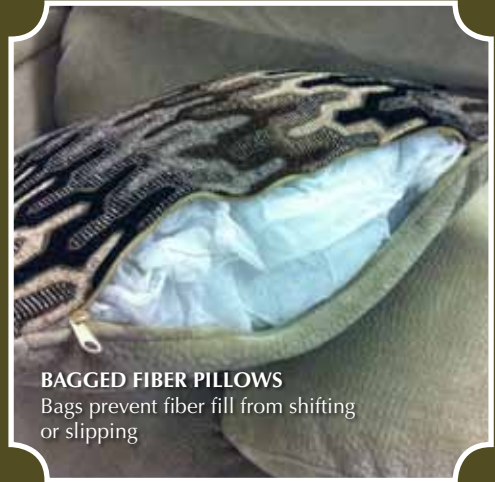
BAGGED FIBER PILLOWS Bags prevent fiber fill from shifting or slipping