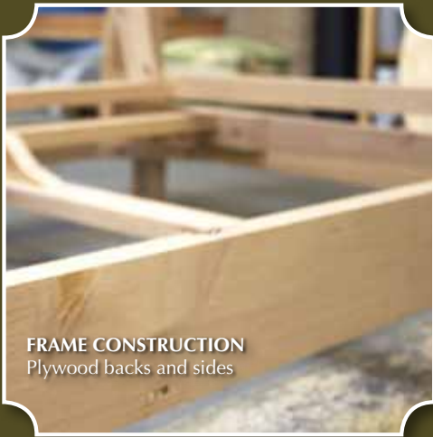
FRAME CONSTRUCTION Plywood backs and sides