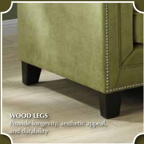
WOOD LEGS Provide longevity, aesthetic appeal, and durability