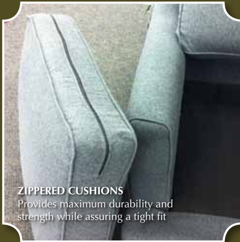
ZIPPERED CUSHIONS Provides maximum durability and strength while assuring a tight fit