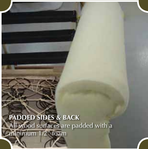
PADDED SIDES & BACK All wood surfaces are padded with a minimum 1/2" foam