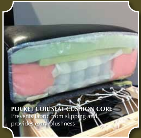
POCKET COIL SEAT CUSHION CORE Prevents fabric from slipping and provides extra plushness