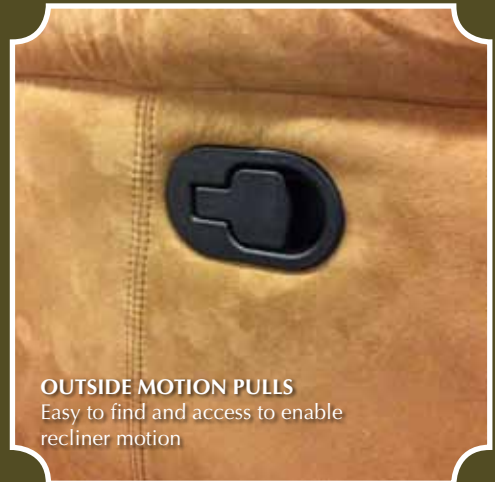
OUTSIDE MOTION PULLS Easy to find and access to enable recliner motion