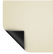
Video Spectra 1.5