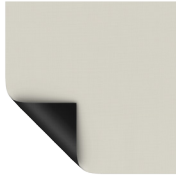
High Contrast Matte White