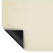
Video Spectra 1.5