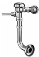
REGAL 120 XL