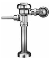
REGAL 110 XL