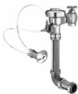
REGAL 9603 XL