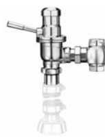
DOLPHIN TYPE 1 CLASS A

**Contact Your Local Sloan Representative