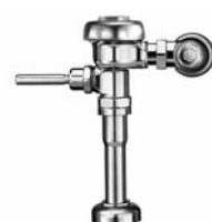
REGAL 180 XL

**Contact Your Local Sloan Representative