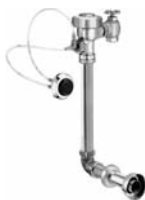
REGAL 940-1.6 XL