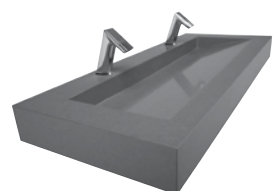
DSG-82000 W/BASYS™ FAUCETS