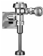
ROYAL 186 ES-S