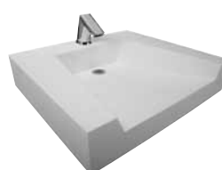
DSOF-81000 W/BASYS™ FAUCET