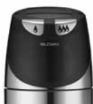
SOLIS DF RESS