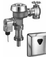
ROYAL 194 ES-SM

**Contact Your Local Sloan Representative