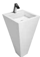
DSUP-81000 W/BASYS™ FAUCET