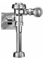
ROYAL 180 ES-S