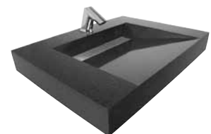
DSWD-81000 W/BASYS™ FAUCET

**Contact Your Local Sloan Representative