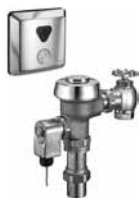
ROYAL 150 ES-SM