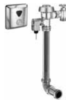
ROYAL 152 ES-SM

**Contact Your Local Sloan Representative