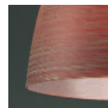
Sandy - Red