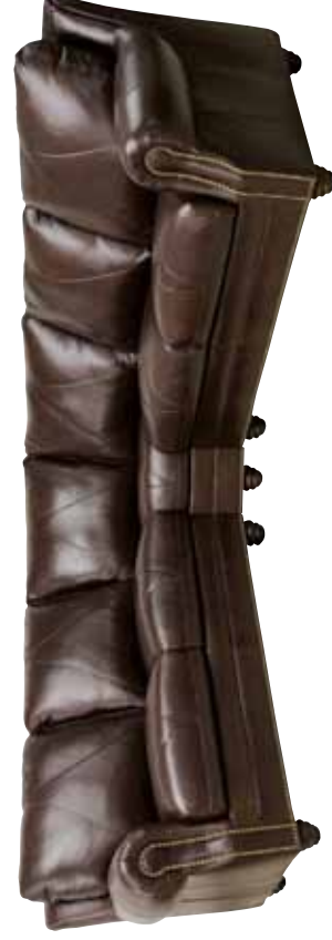
2 Seater Right Arm Facing/Corner/2 Seater Left Arm Facing

*Inside Width indicates distance between each arm. Package Weights: Sectional 300 lbs.