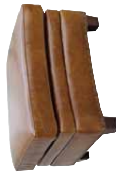
Ashton Storage Ottoman

* Please reference our website ( www.LukeLeather.com ) for all stock status (helpful links, stock status). You can special order in any of our leathers. Please allow 14 weeks for delivery. Please email all orders to scott@lukeleather.com or fax 336.899.8460. You will find more product and leather information on website.