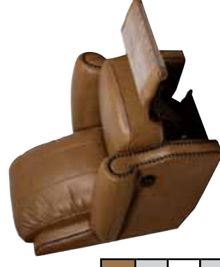
Bennett Recliner Special Order Only