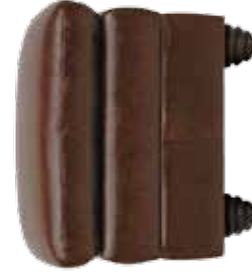
Levi Storage Ottoman

* Please reference our website ( www.LukeLeather.com ) for all stock status (helpful links, stock status). You can special order in any of our leathers. Please allow 14 weeks for delivery. Please email all orders to scott@lukeleather.com or fax 336.899.8460. You will find more product and leather information on website.