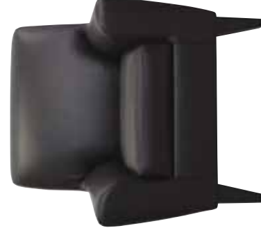
310 Soft Black