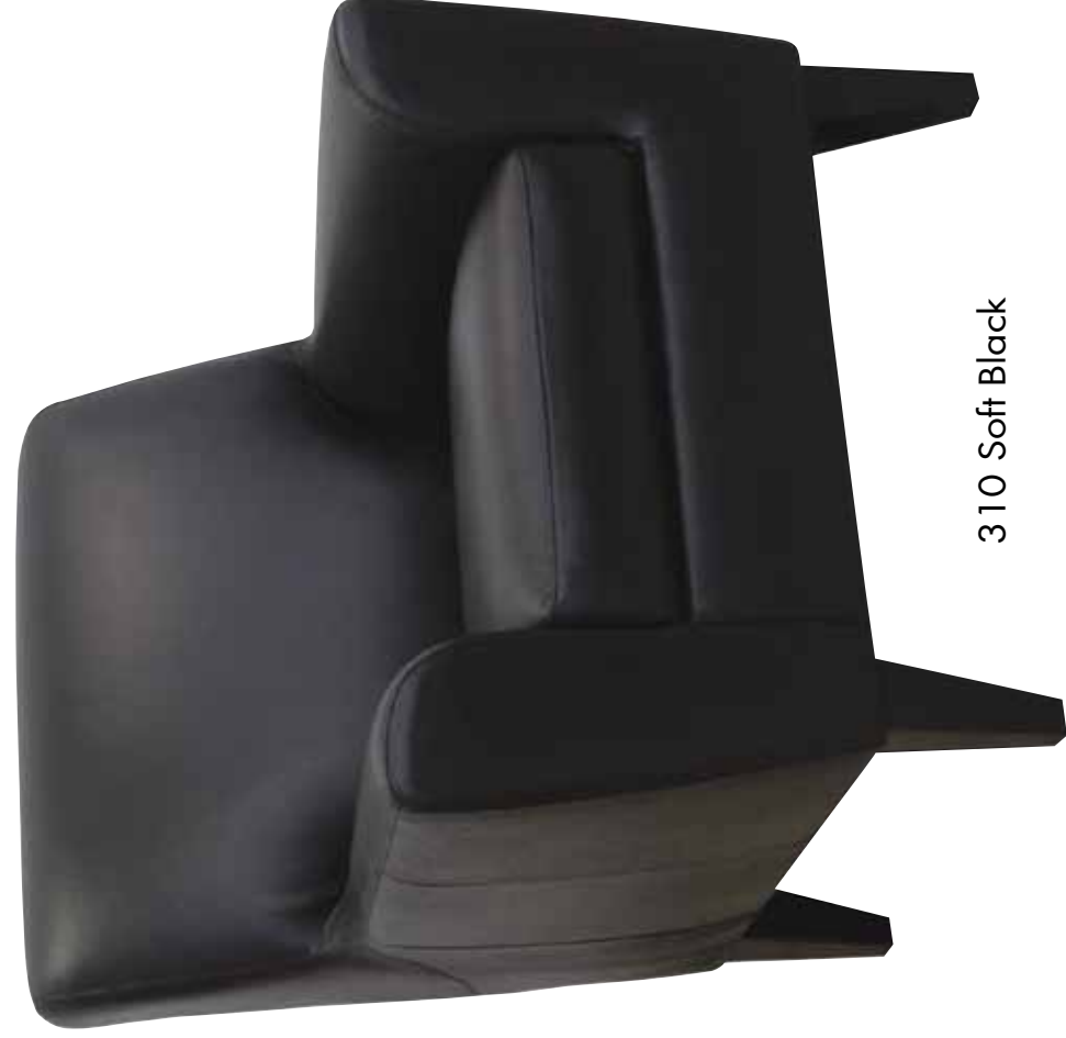
310 Soft Black