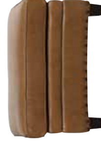
Bennett Storage Ottoman

* Please reference our website ( www.LukeLeather.com ) for all stock status (helpful links, stock status). You can special order in any of our leathers. Please allow 14 weeks for delivery. Please email all orders to scott@lukeleather.com or fax 336.899.8460. You will find more product and leather information on website.