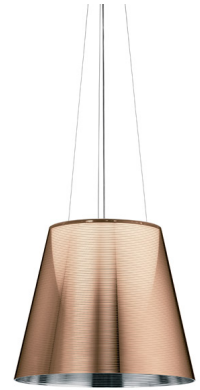
● FU625846 Aluminized Bronze