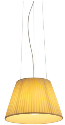
FU610507 Plisse Cloth