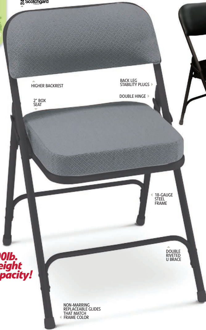
MODEL 3201 SHOWN