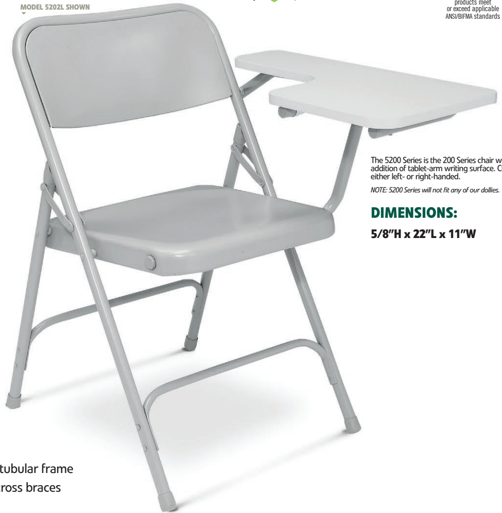
MODEL 5202L SHOWN

The 5200 Series is the 200 Series chair with the addition of tablet-arm writing surface. Choose either left- or right-handed.