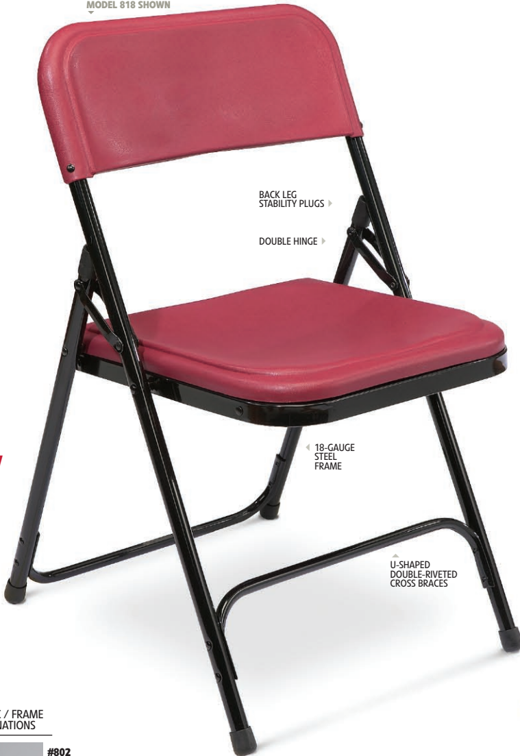
MODEL 818 SHOWN