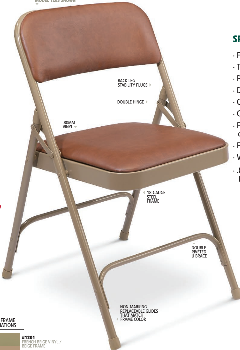
MODEL 1203 SHOWN