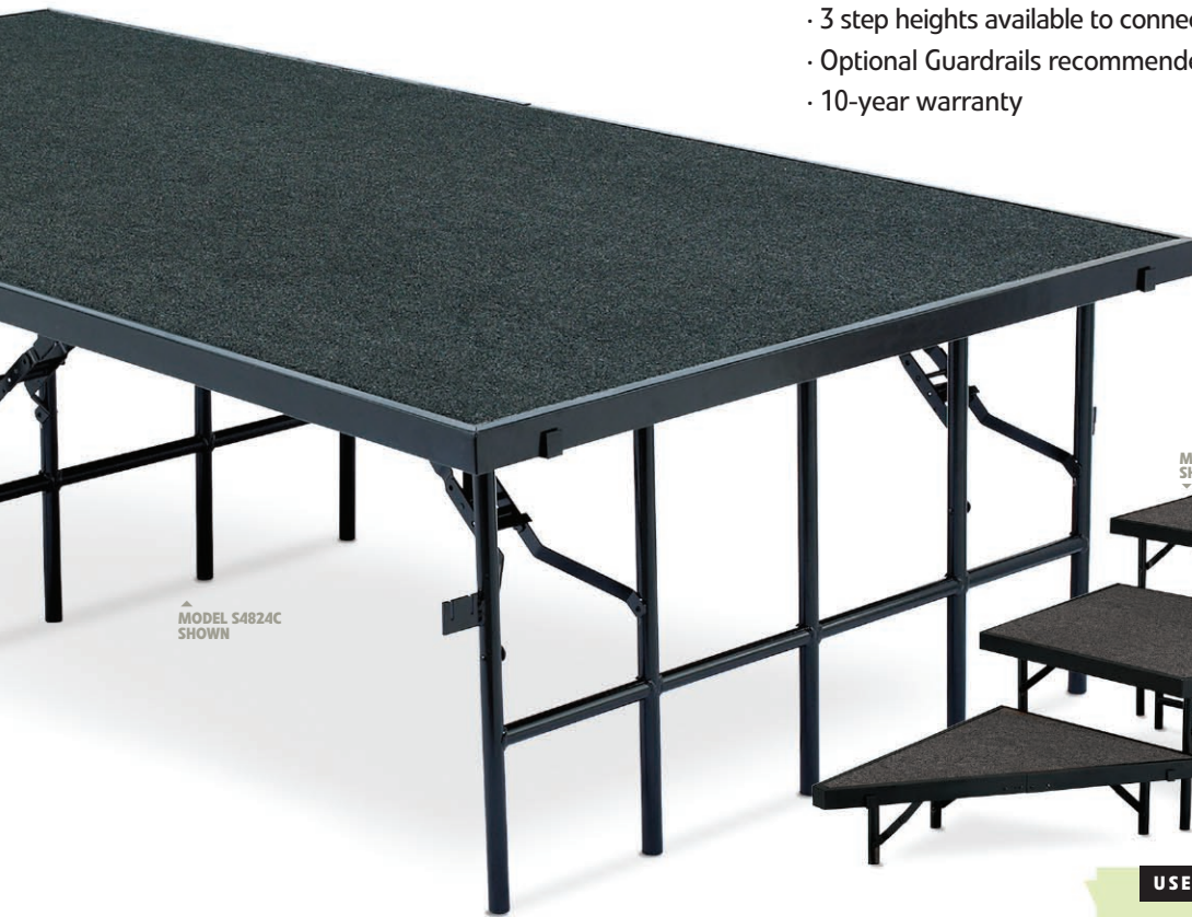
MODEL S4824C SHOWN