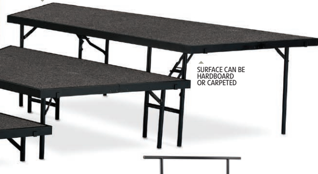
MODEL SPST48C SHOWN