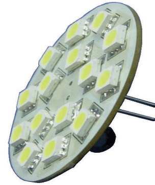
Back pin mounting Wafer

The high brightness Wafer uses only 3W compared to a 35W traditional halogen light source. The bi-pin fits into any G4 size fixture socket providing high performance, energy saving, and long lasting light output. Available in back pin and side pin mount.