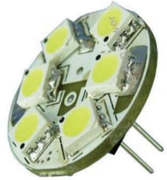
Back pin mounting Wafer

The high brightness Wafer uses only 1.5W compared to a 25W traditional halogen light source. The bi-pin fits into any G4 size fixture socket providing high performance, energy saving, and long lasting light output. Available in back pin and side pin mount.