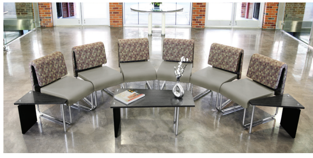
Model 420 Uno Lounge Chair Shown with Profile tables 2010, 2012 & 2014