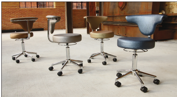
Model 910 Anatomy Chair