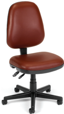
119-VAM Straton Series Task Chair