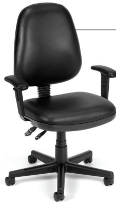
119-VAM-AA Straton Series Task Chair with Arms