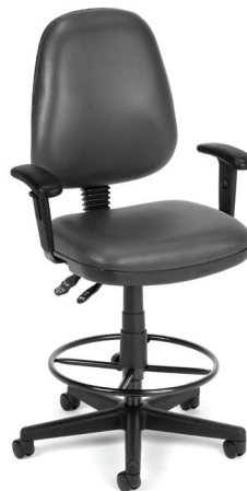
119-VAM-AADK Straton Series Task Stool with Arms