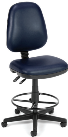
119-VAM-DK Straton Series Task Stool