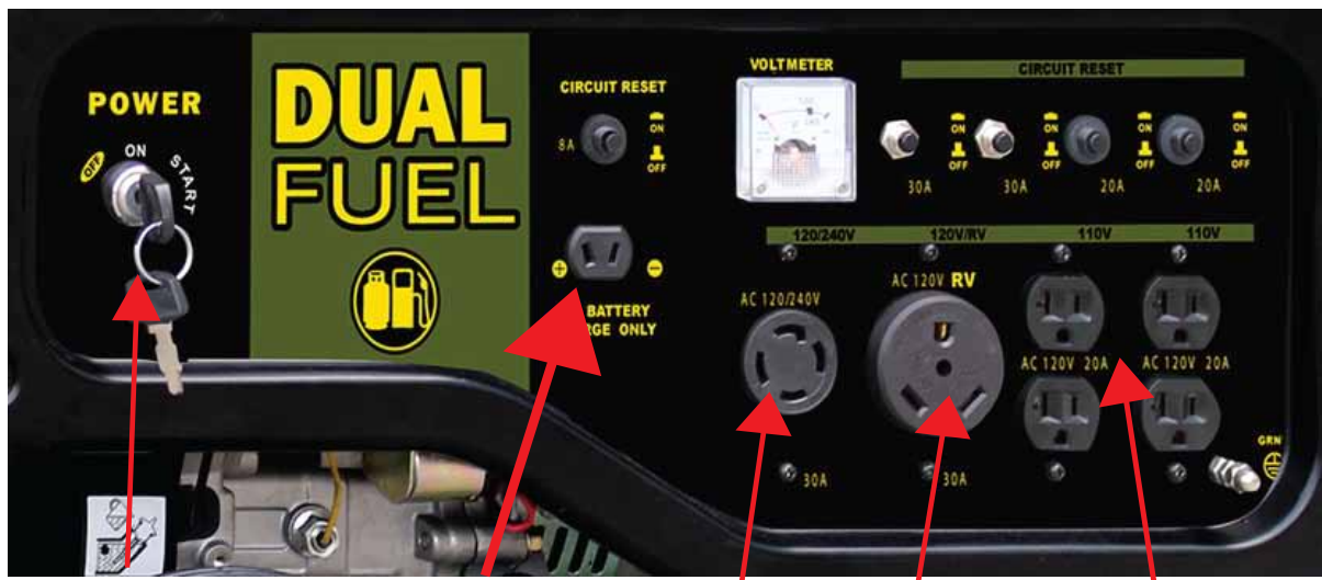
Engine Switch 12V DC 120/240V AC 120V AC RV 4 EACH 120V AC

Outlets available on this generator, from left to right: 12V DC, 120/240V AC, 120V AC RV, and 4 each 120V AC.