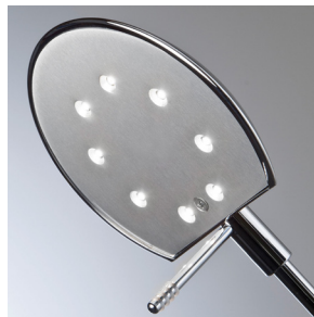
Detail of LED Reflector