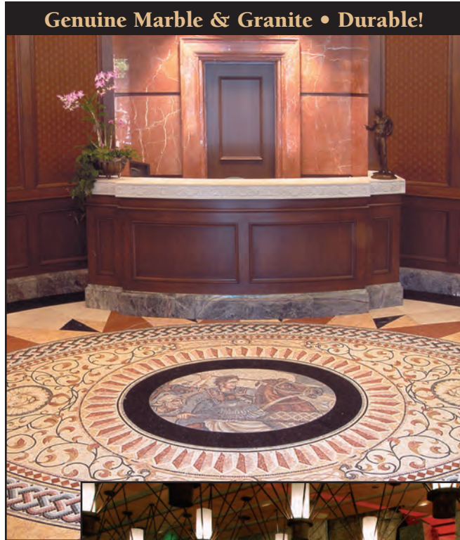
Genuine Marble & Granite • Durable!