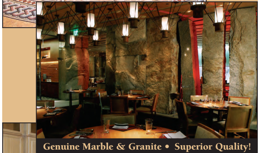
Genuine Marble & Granite • Superior Quality!