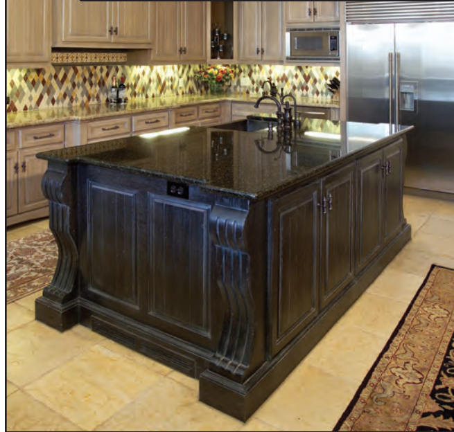
Genuine Marble & Granite • Offers Value!