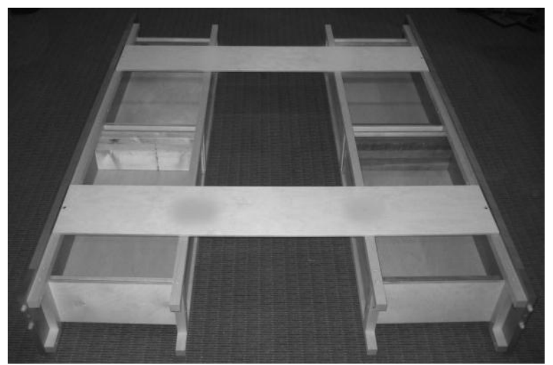
Attach 2 of the plywood deck pieces across the top near either end of the storage rails (See image above) using a #10 \times 1 \frac{1}{2} screw in the hole at the end of each piece. The remaining holes will not be utilized.

Place each side rail/storage unit near where you intend to have them once you have the bed fully assembled. The headboard will attach to the end with more space between the drawer and the end.