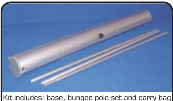
Kit includes: base, bungee pole set and carry bag (not shown)