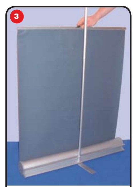
Lean the bannerstand backwards and extend the banner by lifting the top rail until the complete image is visible.