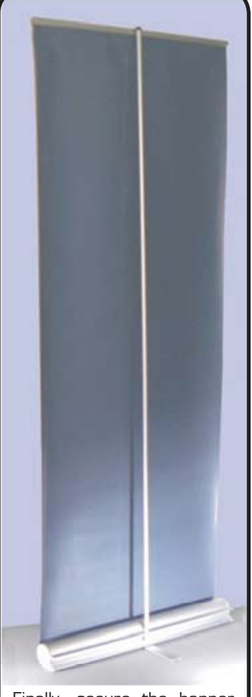
Finally, secure the banner by locating the top rail cup over the pole