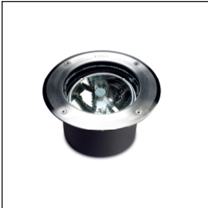
The photograph may not match the reference exactly. Please read the product description to identify the finish.