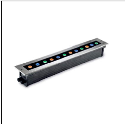
The photograph may not match the reference exactly. Please read the product description to identify the finish.