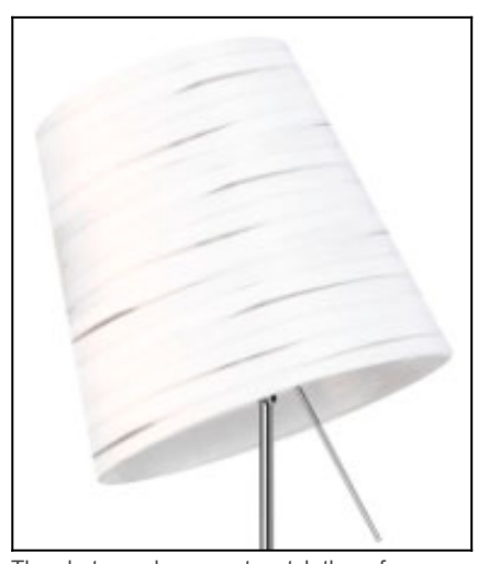
The photograph may not match the reference exactly. Please read the product description to identify the finish.