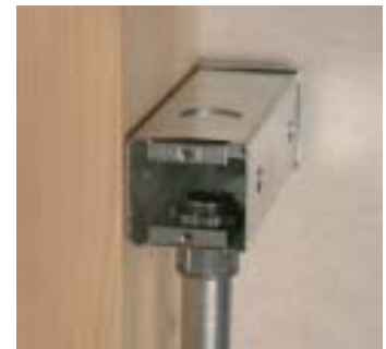
Mini Jbox by LumenArt