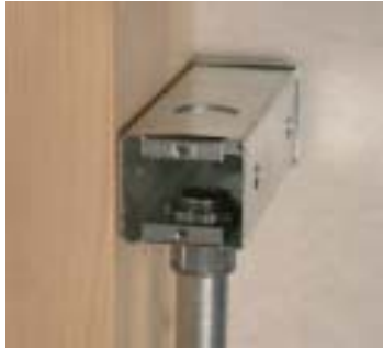
Mini Jbox by LumenArt