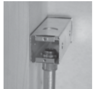
Mini Jbox by LumenArt