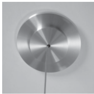
Optional 4" canopy