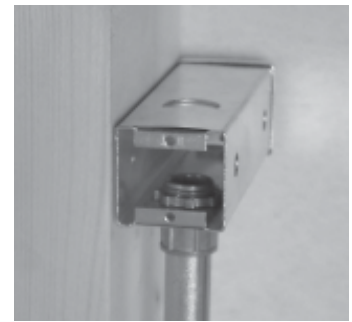
Mini Jbox by LumenArt