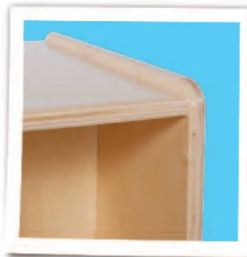
Typical Corners & Edges