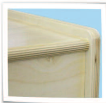
Typical Recessed Plywood Backs