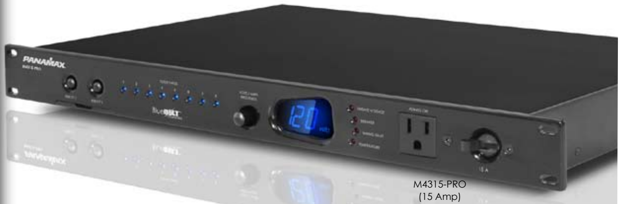
M4315-PRO (15 Amp)