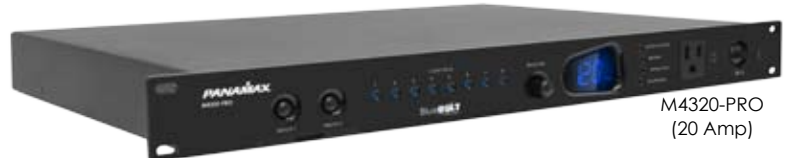
M4320-PRO (20 Amp)

BlueBOLT™ Provides Web Based Remote Power Management to Monitor and Control Your System - From Anywhere, 24/7.