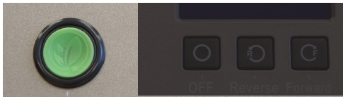
GoECO™ Power ON