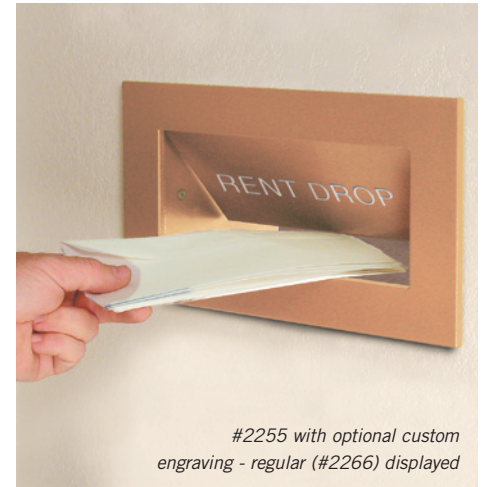
#2255 with optional custom engraving - regular (#2266) displayed