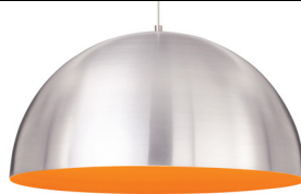
satin nickel/sunrise orange