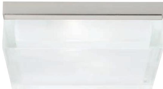
BOXIE, LARGE Shown approximately 15% actual size.