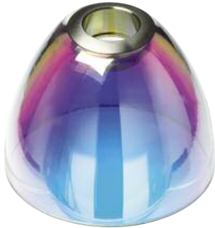
Shown approx. 45% actual size.