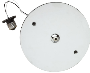
Shown approx. 10% actual size.