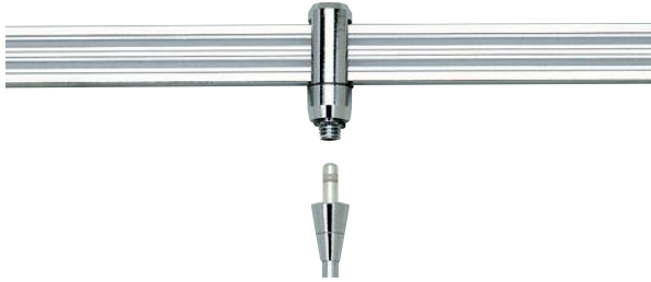
Shown approx. 30% actual size.