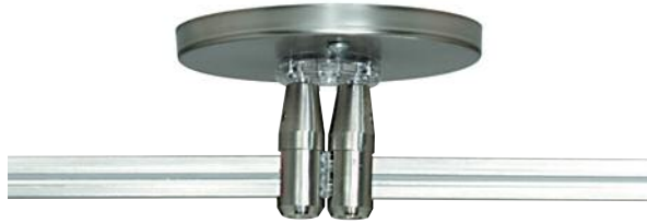
Shown approx. 35% actual size.