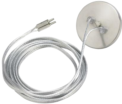
Shown approx. 20% actual size.