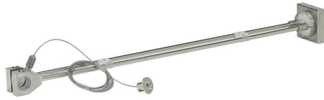
Shown approx. 5% actual size.