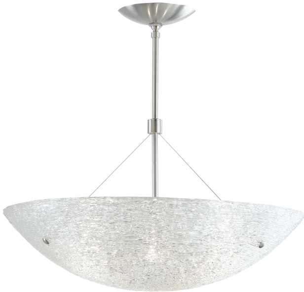
Shown approximately 10% actual size.